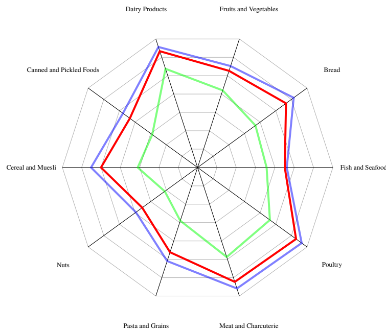
Fig. 2. Average importance of Swedish origin: red=total, blue=female, green=male

Comparing between respondents, those who identified as female valued COOL, on average, higher for all product categories than those who identified as male (Figure 2). The highest valued category amongst those who identified as female was Poultry ( \bar{x}=6.66 , \tilde{x}=7 , s=2.15 ), and the category with the lowest average value was Nuts ( \bar{x}=3.95 , \tilde{x}=4 , s=2.09 ). Those who identify as male value Dairy Products highest ( \bar{x}=5.38 , \tilde{x}=7 , s=2.71 ), and Nuts lowest ( \bar{x}=2.1 , \tilde{x}=2 , s=0.99 ).