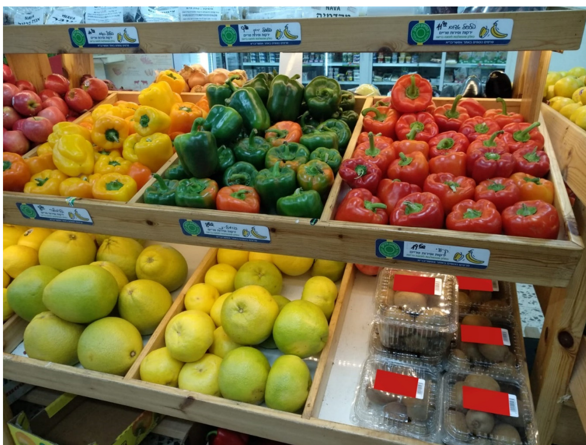
Figure A3. Labeling unpackaged fruits and vegetables in a grocery shop.