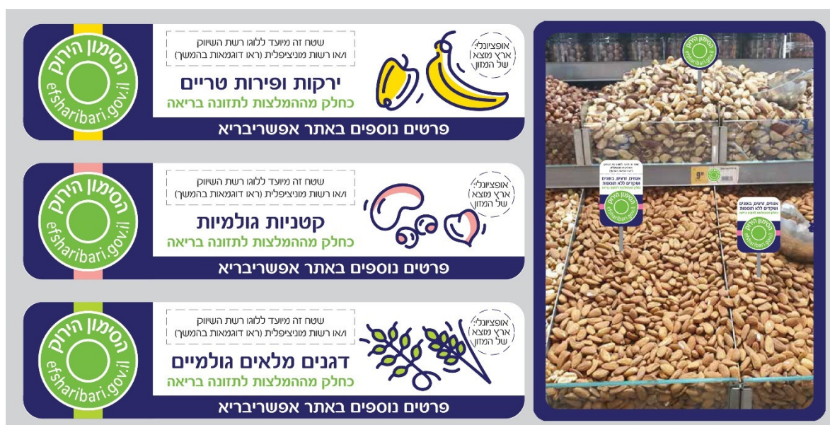
Figure A2. Israeli Ministry of Health proposal for labeling unpackaged foods at the point of purchase.